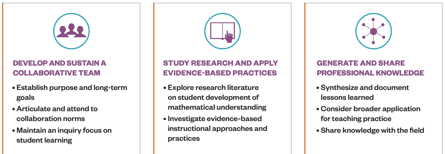
Figure 2. Implementation Practices

developing and abiding by team collaboration norms, and maintaining an inquiry focus on student learning (rather than faculty evaluation) throughout the process. The second is to study research and apply evidence-based practices . Without this emphasis, LS participants may design and refine lessons in ways that are counter to the best available evidence on student learning. The focus on research on instruction allows instructors to translate empirical evidence into classroom practice. The third implementation practice is to generate and share professional knowledge . If the time invested in LS is to have long-term benefits, and if LS is to be scaled up to include more faculty, learnings must be made explicit and shared. Observations about the adaptation of LS at the three Oregon community colleges that we share below are focused on these three implementation practices.