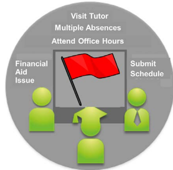
Early Alerts & Risk Targeting