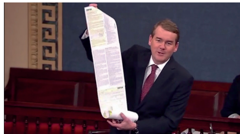
Senator Michael Bennet (D-CO) introduces a bipartisan bill to reduce the 10-page FAFSA to a form the size of a postcard.